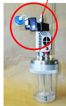
The HEL BIC