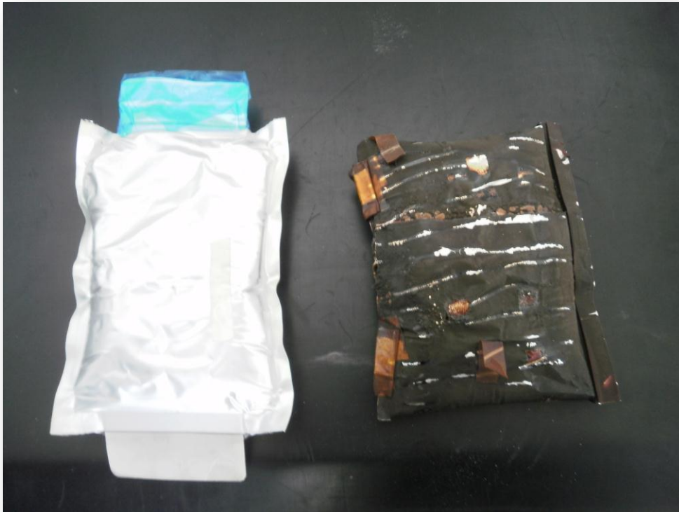
FIGURE 1. LARGE BATTERY BEFORE AND AFTER THERMAL STABILITY TESTING IN BTC

The data below was generated recently by MGL in China from one of their prototypes; photos of the battery before and after testing are provided.