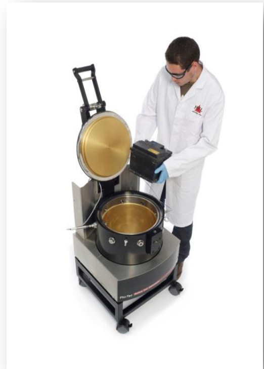
FIGURE 3. BTC CALORIMETER, FOR BATTERY THERMAL STABILITY TESTING

This data was generated using the HEL Battery Testing Calorimeter (BTC) which allows the large and small batteries to be placed directly in the apparatus and tested without any particular knowledge of calorimetry. The BTC has numerous safety features that ensure the operator is totally protected even when large amounts of energy are released.